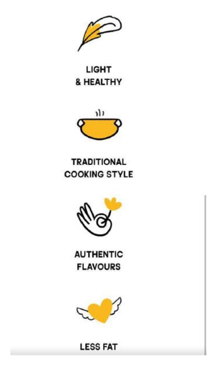
Figure-2: Specialty of responsible biryani