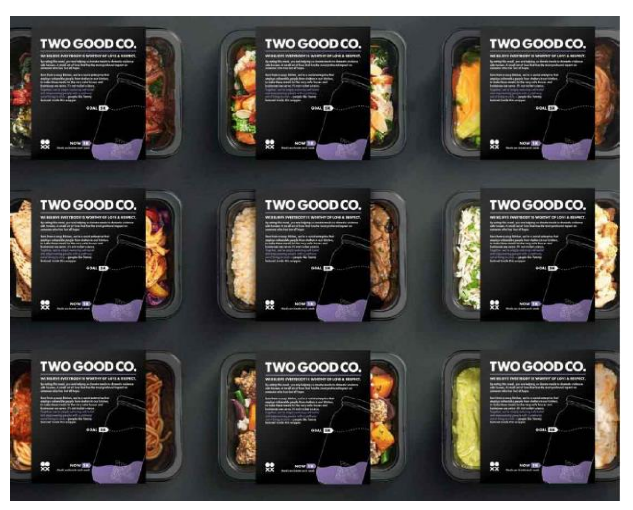
Figure-1: Too good co, products