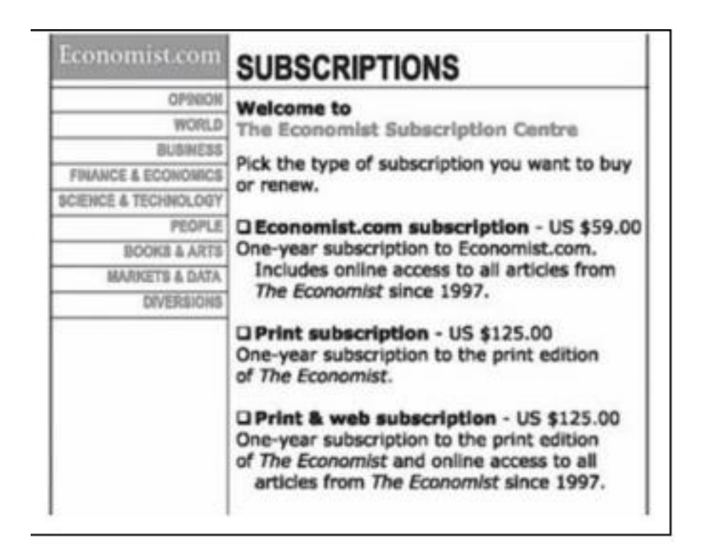
Fig 1- Economist subscription