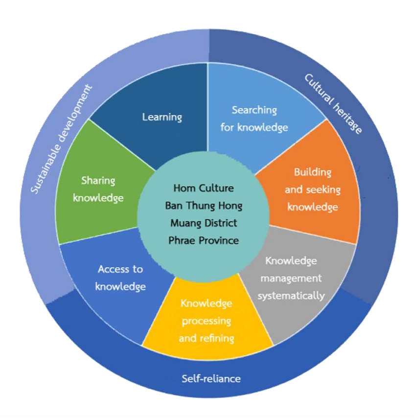
Figure 1: Conceptual framework of the research