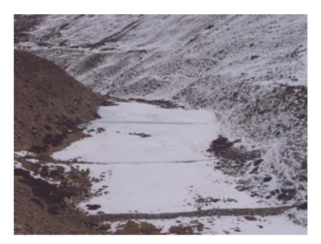
Figure 4: Simple Artificial Glacier Method

Artificial glaciers provide a simple and feasible method of water harvesting introduced by a son of the soil, Engineer Chhewang Norphel. These can be built on or close to a stream fed by perennial natural springs along with structures to store the melted ice during winter. Retention walls of 3-6 feet height may be built at regular intervals in the stream. This is a simple and traditional method used by village communities and is very effective if the stream is not exposed to direct sunlight during the winter months (Figure 4).