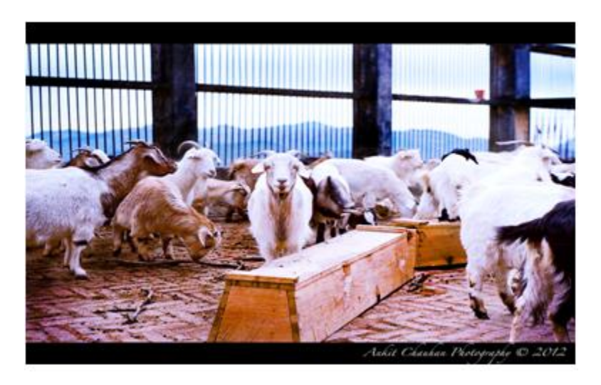
Figure 6: Chegu Goat Farm in Mukteshwar

The Chegu breed which is found in Lahul-Spitti and Kinnaur regions of Himachal Pradesh and Uttarkashi, Chamoli and Pithorgarh areas of Uttarakhand are being bred and reared in Mukteshwar under the All India Coordinated Research Project by Indian Council for Agricultural Research (ICAR) and Indian Veterinary Research Institute (IVRI) (Figure 6).