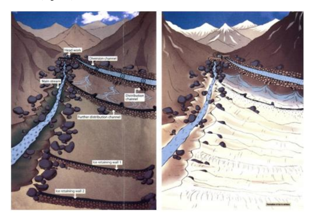
Figure 5: Modern Technique of Artificial Glacier

Alternatively, water can be diverted from the main stream through a narrow diversion canal to a nearby valley facing north or remaining largely under shade through the winter. The water is let into this valley and allowed to freeze through a series of walls built much in line with the previous method (Figure 5).