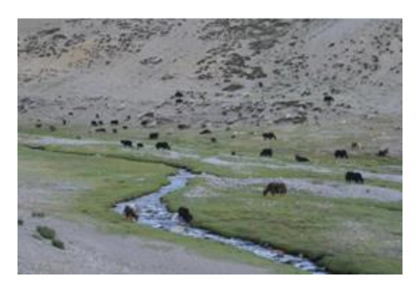
Figure 3: Pastureland near a stream in Changthang

With the rise in the livestock population after the 1960s, the available pastures became overgrazed and sources of dispute. This type of problems generally leads to the tragedy of the commons associated with overgrazing (Hardin, 1968). The balance between the number of livestock and the availability of natural resources such as, fodder and water pose the greatest challenge for a pastoral occupation (Khazanov, 1994). The quality of the pastures and availability of water determine the duration of settlement and pattern of movement of the nomads, further affected by localized droughts and diseases. Global warming and climate change are additional factors that are causing deterioration in the grazing conditions by reducing the supply of free-range feed during drier summers and colder winters. This limits the extent to which goat herds can be expanded. The average available area for single livestock unit is 0.4 hectare in this region which is much lower than the national average of 1.0 hectare. Moreover, there are problems of accessibility, continued negligence of pastures, low level of biomass production, growth of weeds and poisonous plants among others. On top of these, development initiatives for Pashmina will imply larger livestock population and hence greater pressure on the grazing land in future.