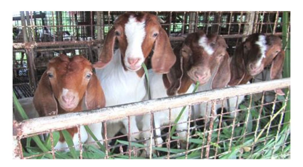
Figure 7: Zero Grazing/ Stall-fed Farming