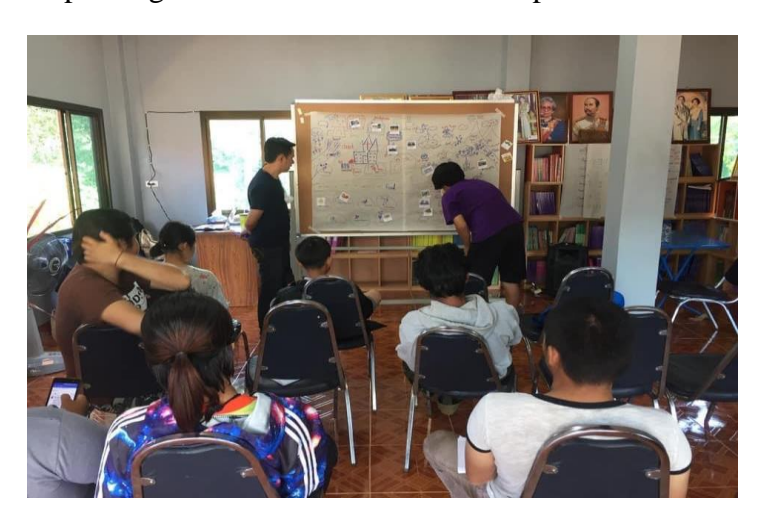
Figure 2: Community Map Activity

3. Provide materials for students to practice speaking, by the event organizers providing materials that will assist students practice speaking as much as possible. Because the media here does not require a large investment, the event organizers utilize existing goods such as wooden sticks. Many colors, legos, board game cards, money, colorful paper with various properties, such as triangles, squares, and circles, are just a few of the items that the event organizers may simply give. The organizers gather vivid images from calendars, photographs, or images found on the Internet and create speaking exercises based on the kids' preferences.