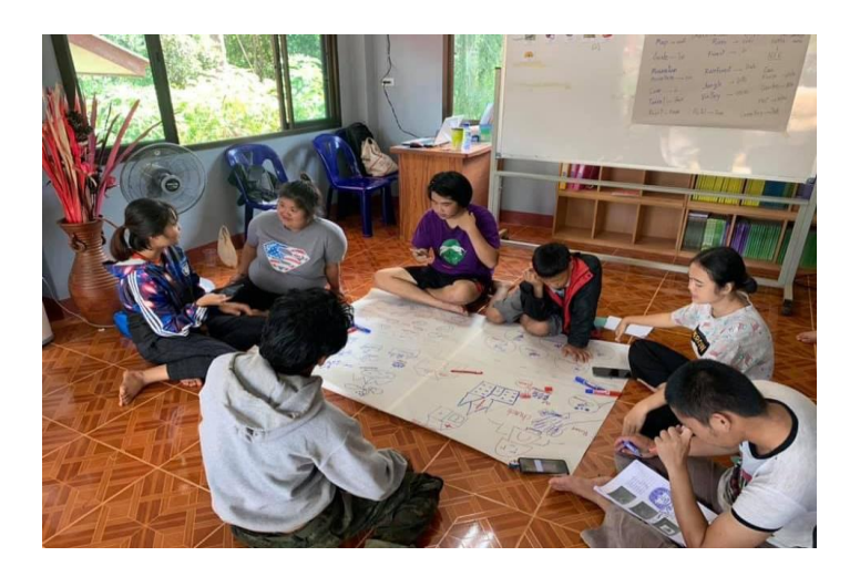
Figure 3: Group activities

4. Using activities in pairs and groups of students learning a second language will reduce speech anxiety, particularly standing alone in front of the class, by allowing students to undertake activities together, whether in pairs or activities. As a result, student anxiety is reduced. It also provides students with enjoyment and passion, motivating them to engage in activities, doing tasks together helps students to feel independent, without the need for a teacher to continually monitor their behavior in front of the class. Couples and group activities also test students' abilities, allowing them to develop creative and problem-solving skills while participating in the activity. As a result, couples and group activities are commonly employed in the teaching of communicative languages. It was discovered through the activities that practicing speaking in pairs gives students more time to practice speaking than if the teacher stood in front of the class and had the students practice at the same time while the teacher supervised the practice, couples can freely use the language of their own abilities while practicing speaking with each other.