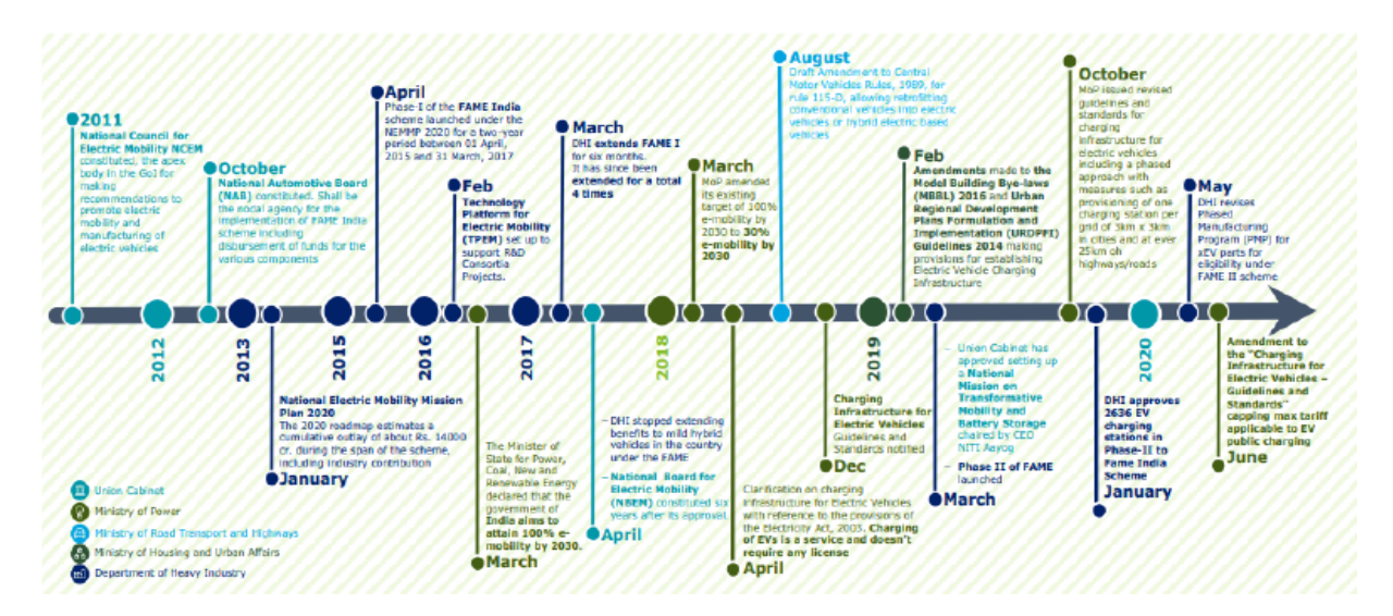
Figure 2: Key initiative for adopting electric vehicles (GIZ & NITI Aayog, 2021).

The major initiative taken by the government was the FAME-I (faster adoption and manufacturing of hybrid and electric vehicles) program which was launched in the year 2015. It was a three-year ambitious initiative to support the market with $1.36 billion to promote alternative technology by inducing financial push in a competitive business (Moerenhout, T., 2021). Subsequently, the government introduced the second phase of the ambitious scheme named FAME-II, launched in 2019. The project was further amended and expected the sale of a two-wheeled electric vehicle of approximately six million units by 2025 (GIZ & NITI Aayog., 2021).