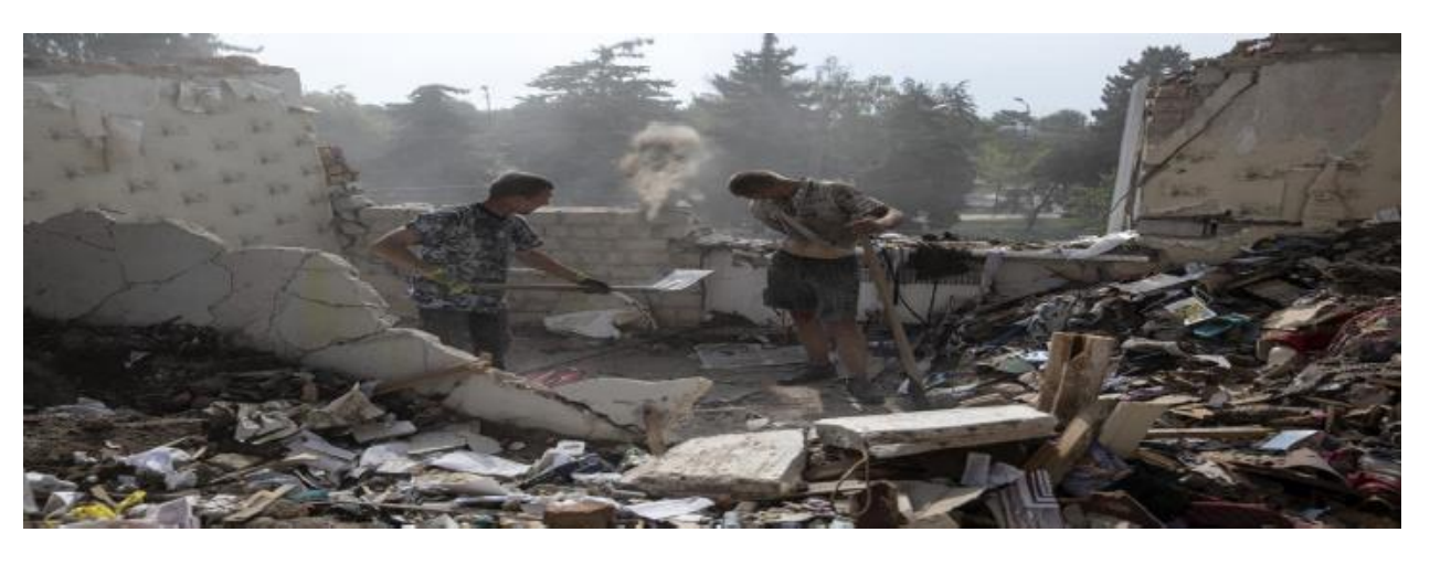
Figure 1: Images of Destruction due to the War

An attempt is made to study the effect of this war in terms of humanitarian, economic and political impact of the war. Will there be a solution or will it follow the length of the 'cold war'. At this point it is difficult to predict the end of this war, but the adverse impact has already been felt across the world. Governments are grappling with shortages, high inflation, and huge fiscal deficits. Ukraine and Russia are grappling with their own set of problems namely widespread destruction and huge loss of human lives. Countries will eventually find a solution to the economic issues they are facing, but what about the people who have lost their lives.