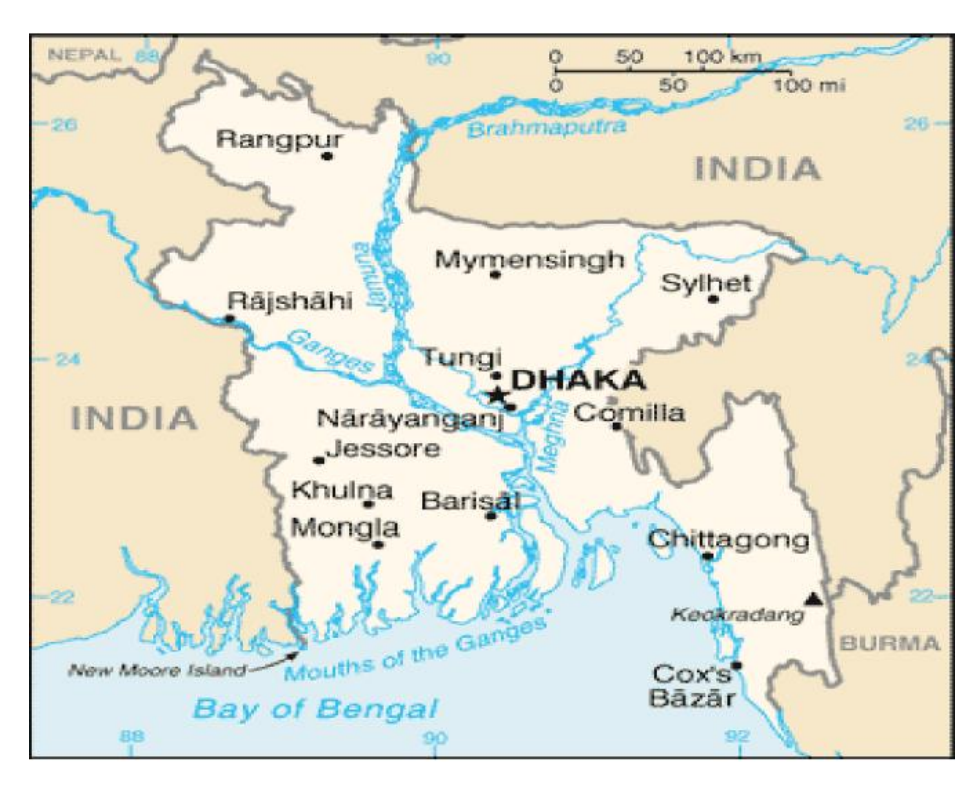
Figure 3: Map of Bangladesh

When professor Yunus was not able to solve the issue with traditional banks, he started an institution of his own called Grameen Bank. The word 'Grameen' means village in Bengali. What he wanted to portray by this name was that capital is a friend of the poor and this is the only means for them to move out of poverty. By being a part of this venture, they would be in a position to escape poverty which had not been achieved earlier due to wasteful, corrupt, and incompetent government as well as international aid organisations. According to him, this bank would address all aspects of rural life from manufacturing to retail even door-to- door sales. The bank would not require collateral. And it would prove what Righter later referred to as "the bankability of the unbankable". It was in 1983 that Grameen was incorporated as a bank after the government had passed legislation allowing the bank to accept deposits.