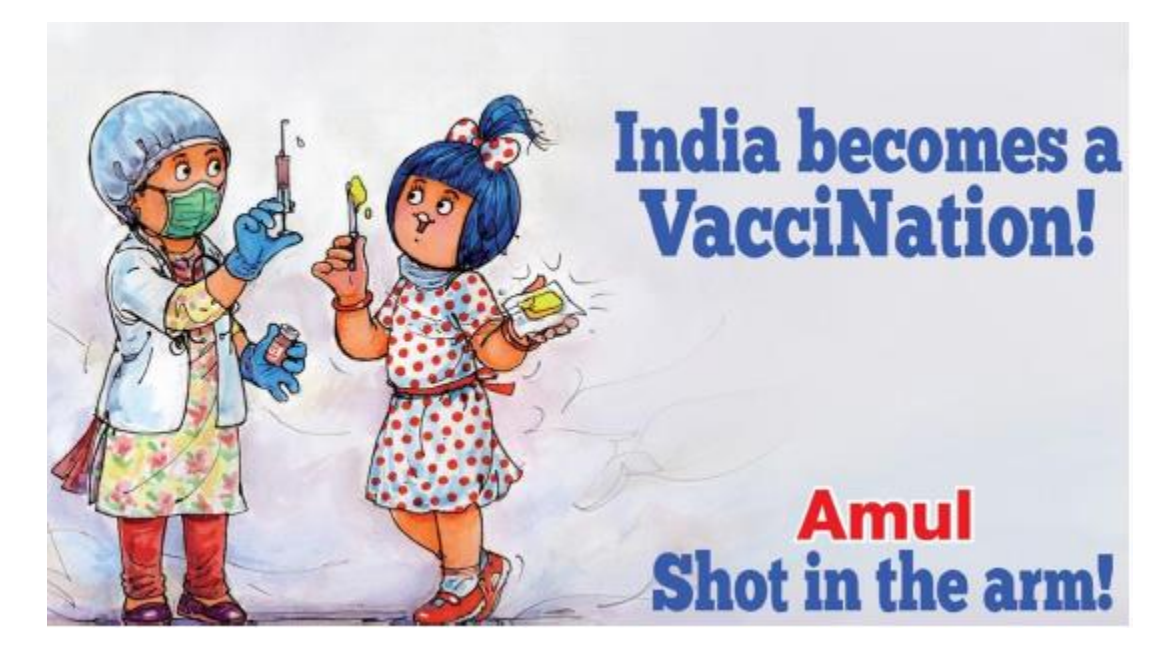
Figure 4: Amul cooperative advertisement

Everyone looks forward to the Amul Girls advertisement and billboards.