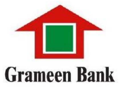
Figure 2: Grameen Bank

The Grameen Bank was started in the 1970s by its founder Muhammad Yunus.