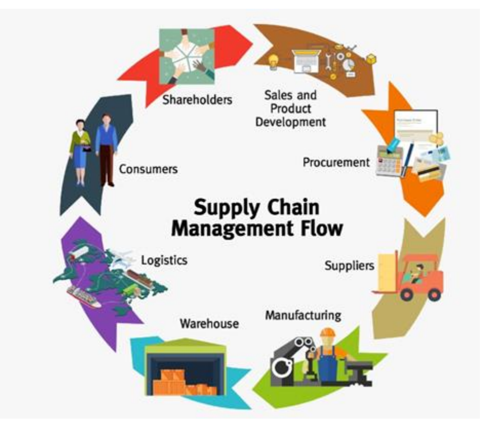
Figure 1 Supply Chain Management Flow

Supply chain management has been defined as the "design, planning, execution, control, and monitoring of supply chain activities with the objective of creating net value, building a competitive infrastructure, leveraging worldwide logistics, synchronizing supply with demand and measuring performance globally." There are basically three objectives of SCM: to decrease stock, to speed up exchanges with ongoing information trade, and to increment income by fulfilling client demands more effectively.