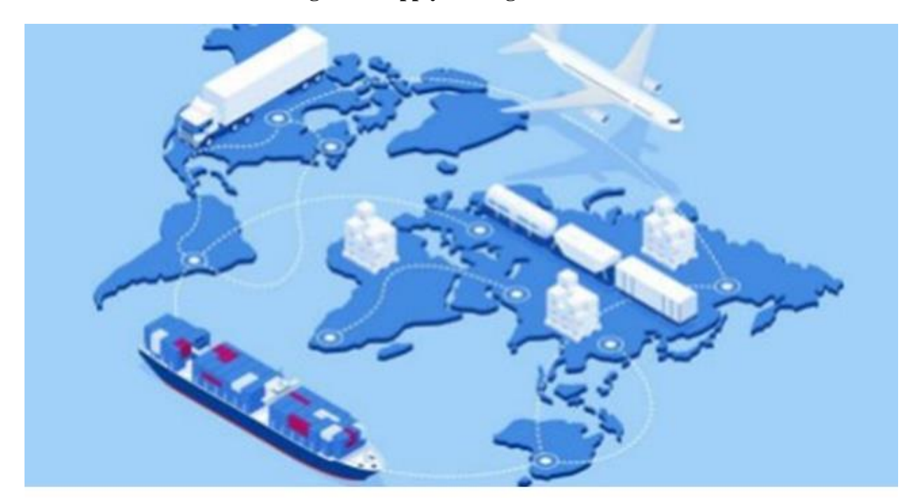
Figure 3 Supply chain globalization

made in various countries including China and the finished good is transported to the US and Europewhere it is sold.