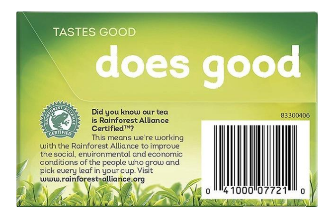
Fig. 3. Packaging, Lipton Tea, Unilever.

However, an investigation by Greenpeace found that Unilever's definition of sustainable palm oil did not align with international standards and included suppliers linked to deforestation. This concept of "sustainable palm oil" has also been criticized for being misleading, as many producers that claim to produce sustainable palm oil still engage in practices that are harmful to the environment and local communities. For example, a study by the Center for International Forestry Research (CIFOR) found that many palm oil producers in Indonesia and Malaysia, who are certified as sustainable by the Roundtable on Sustainable Palm Oil (RSPO), still engage in activities such as clearing primary forests, draining peatlands, and violating the rights of local communities.