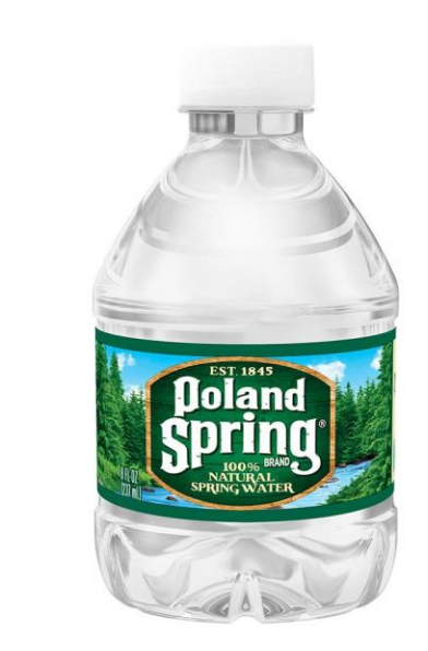
Fig. 2. Packaging, Poland Spring.

Now, we must reposition our attention towards Nestlé, a Swiss multinational food and drink processing conglomerate corporation headquartered in Vevey, Vaud, Switzerland. Being the largest food company in the world measured by revenue, and ranked No. 72 on the Fortune Global 500 in 2019, it becomes both striking and concerning to look at the various allegations against the company's deliberate attempts at greenwashing.