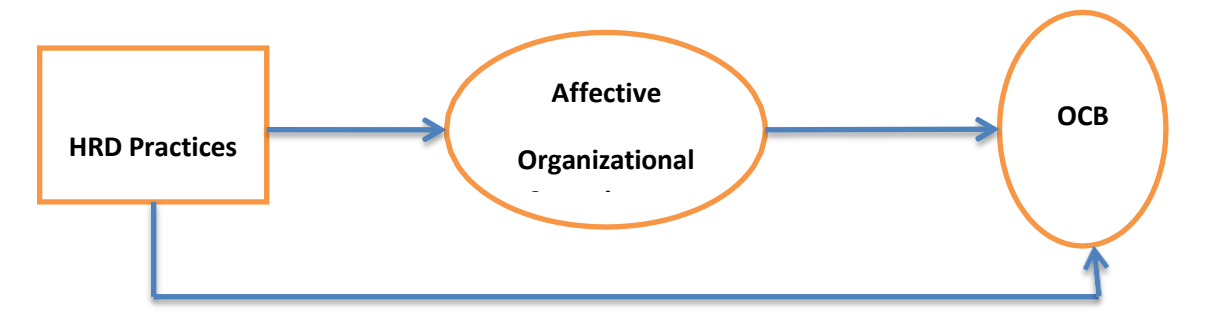
Figure 1: Conceptual Framework